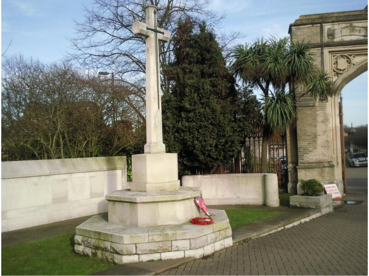
Cross of Sacrifice near Entrance to West Norwood Cemetery