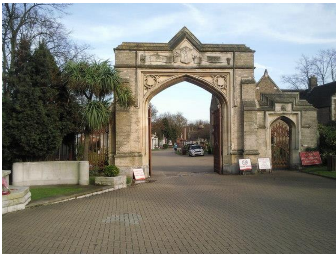
Entrance to West Norwood Cemetery